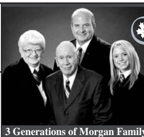
3 Generations of Morgan Family